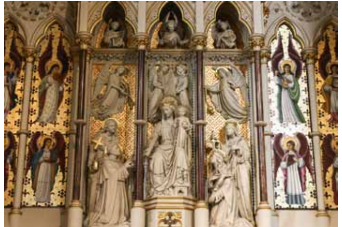
Our Lady of the Rosary Shrine, London England